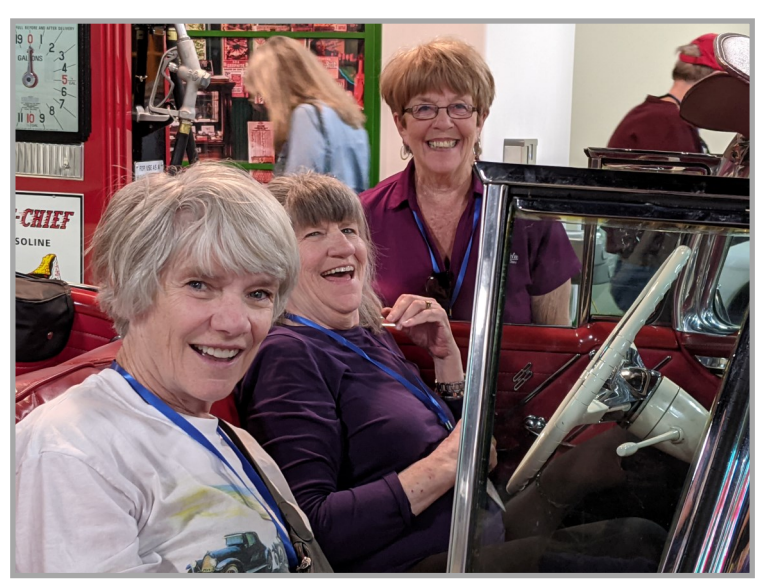
All is well - we were just fooling