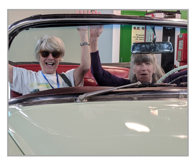
Thelma and Louise as they drive off the cliff