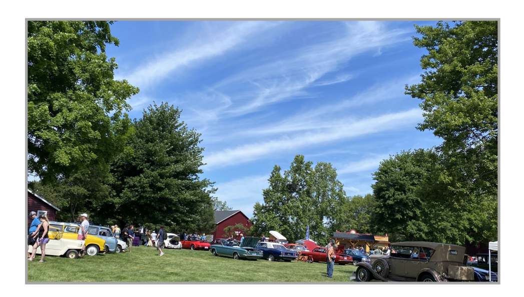
Giving rides at the Gilmore Museum