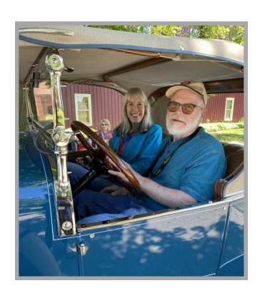
A Wonderful Time was had by All