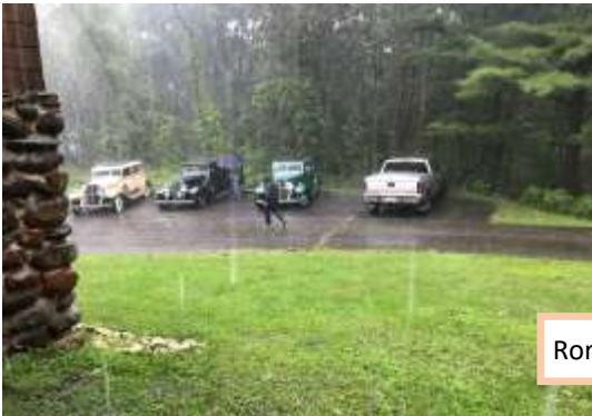
Ooh laughing in the rain walking hand & hand

(1) The Community Theatre Production of The Producers far exceeded any 'community' theater production I have ever seen. (2) Backbone Park is a perfect place to drive an old car, many forks, beautiful road but the hurricane limited visibility. (3) The 10C speedster brought out the maniacal motorist in me. GREAT! (but cold) Bouvard Hosticka