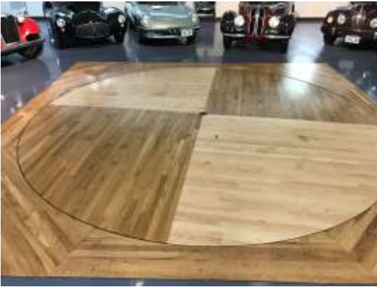
Will it go round in circle?