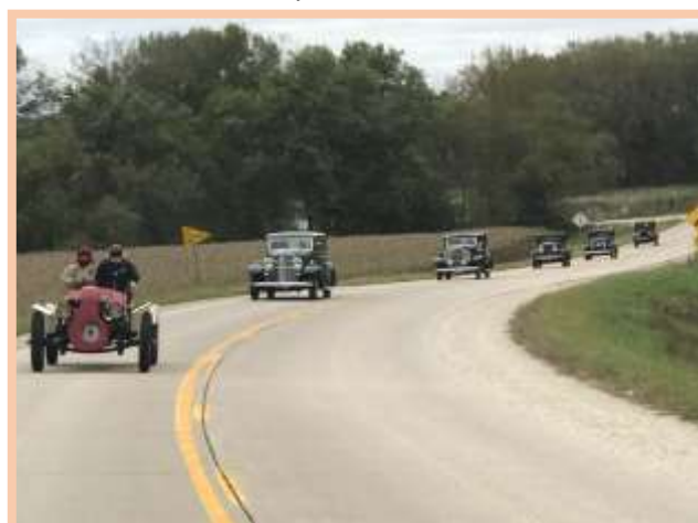
Speedster in the Lead!