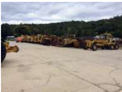
A lot of iron!