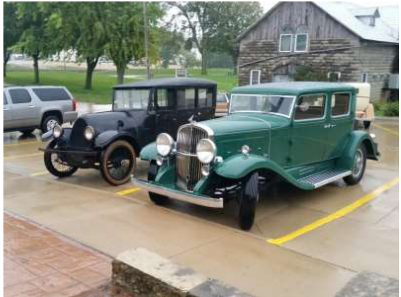
First tour in the 1923