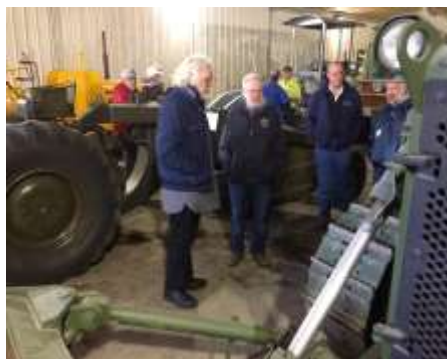
Viewing military dozer