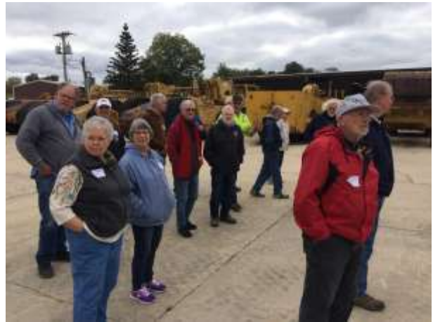
Caterpillars just look like all of this STUFF!