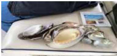
That's a lotta clams!