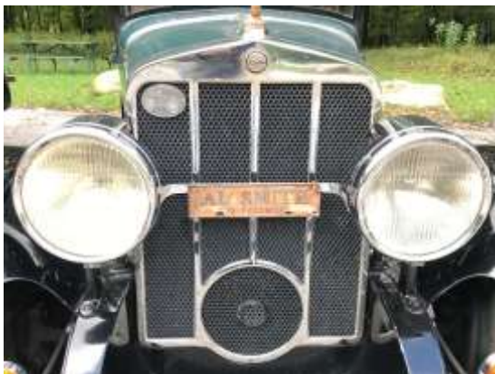
Bill Eby's license plate topper social media ca. 1928

It's been hours since we've eaten and we're STARVING!