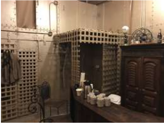
The Breakfast Nook

Wonderful community. Very welcoming. Had a great time.