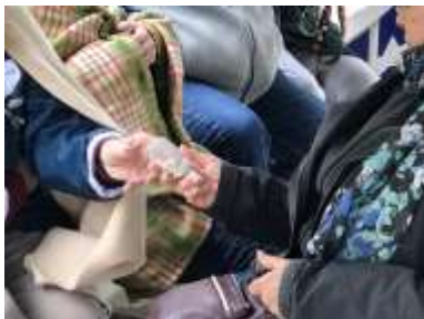
If we didn't know these were pearls, this might look kinda suspicious!

Elkader was a wonderful town. Everyone has been so friendly & accommodating. I would live here! I especially enjoyed the river trip. Learning about the biological and physical changes of the river. And of course, the opera house and play were outstanding.