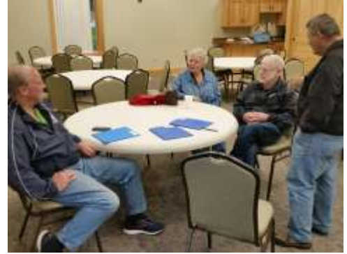
Lovely to see you again my friend