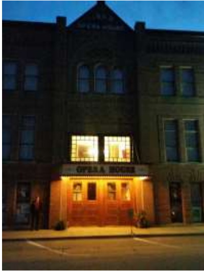
THE Opera House