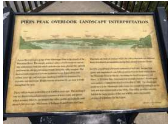
Pikes Peak signage