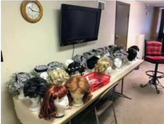
Don't wig out it's just the dressing room!