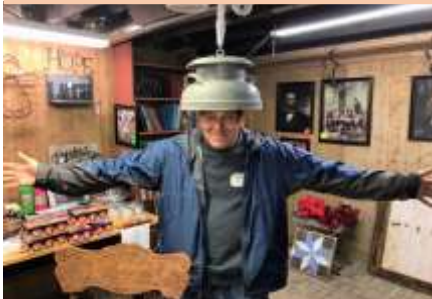
NO Max, Agent 99 isn't here & the Cone of Silence is broken!

Elkader opened their town to the club, not only did the town appreciate the fact that we were there, but their hospitality was over and above, but my most memorable moment was the escort we had back to our rooms late one night because we had not lights on our car. So one car with their 4 ways led us back.